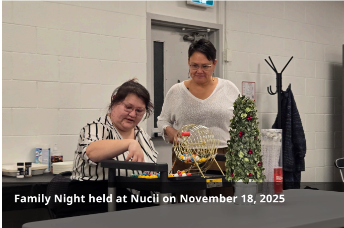
Family Night held at Nucii on November 18, 2025