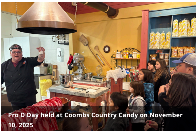
Pro D Day held at Coombs Country Candy on November 10, 2025