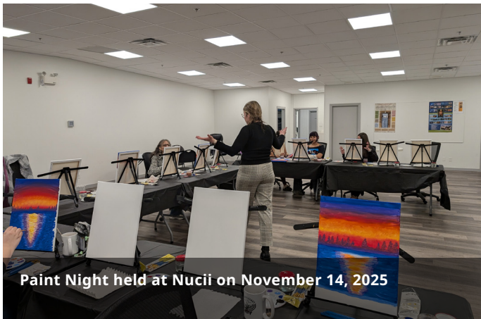
Paint Night held at Nucii on November 14, 2025