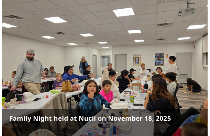
Family Night held at Nucii on November 18, 2025