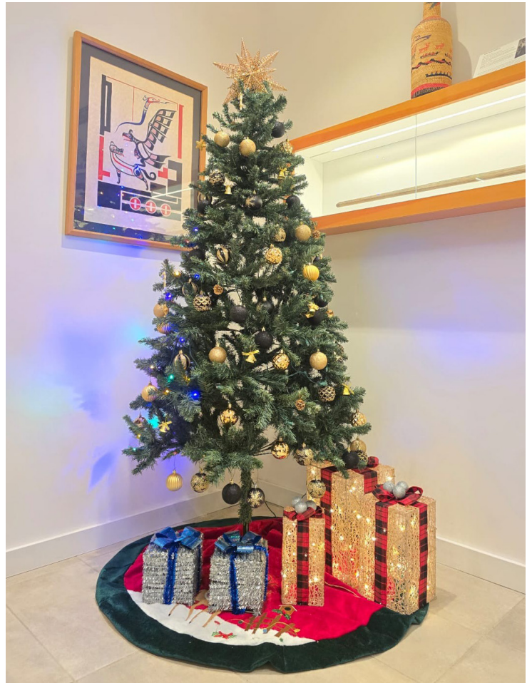
Christmas vibes at UTG