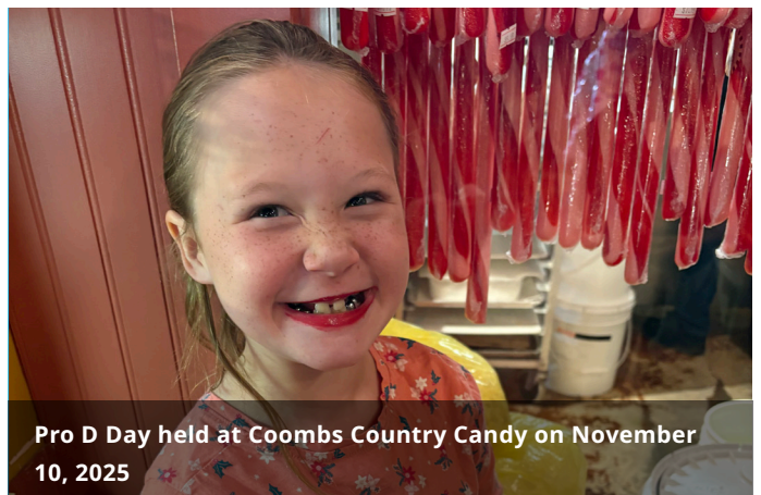
Pro D Day held at Coombs Country Candy on November 10, 2025