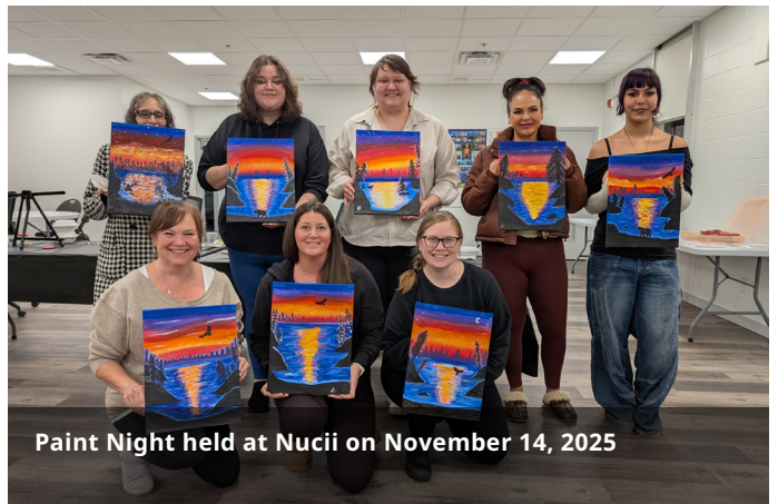
Paint Night held at Nucii on November 14, 2025