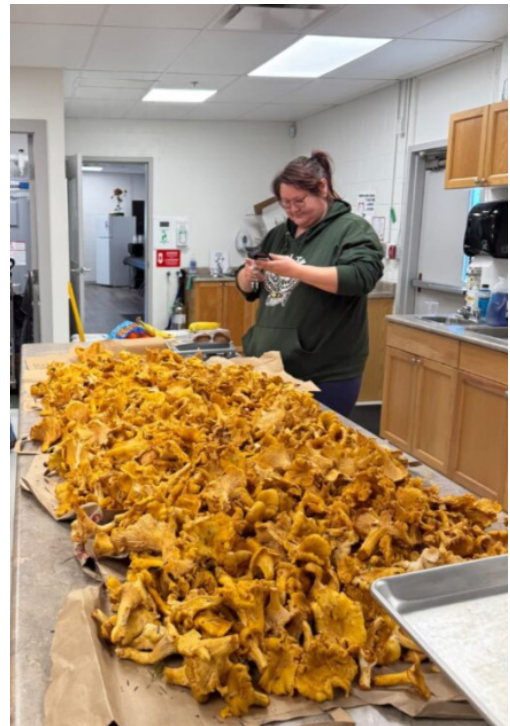
Chanterelle mushrooms harvested from the Uchucklesaht territory!