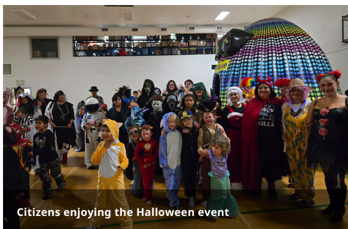
Citizens enjoying the Halloween event